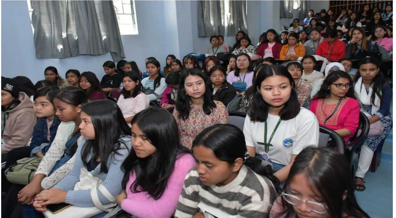
Pic 3: The participants listening actively