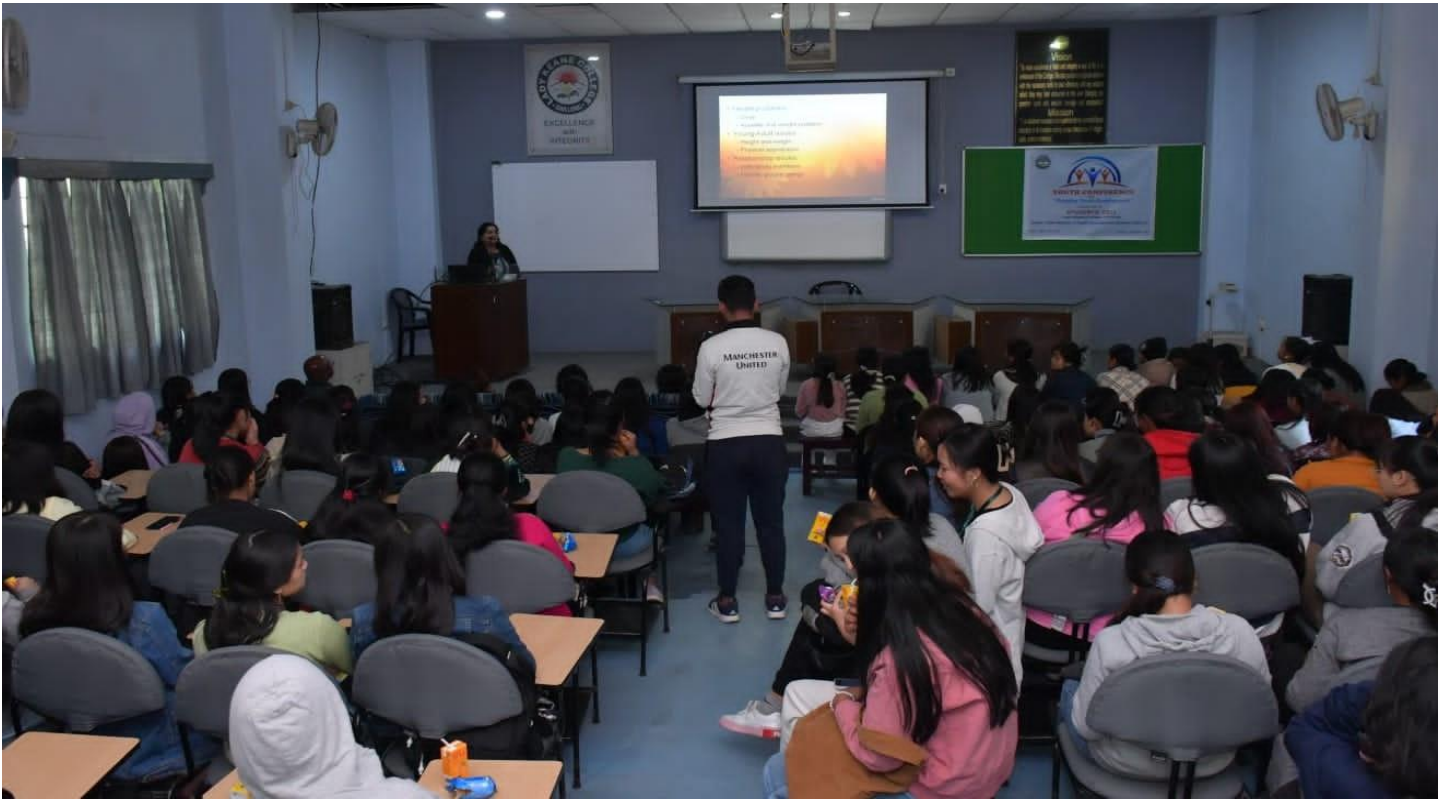
Pic 1: The participants of the Youth Conference